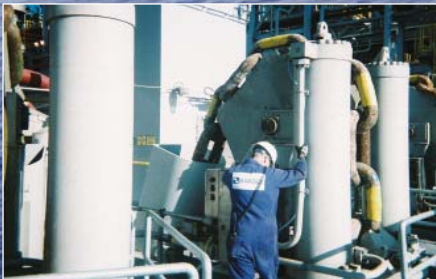
These chain jacks pulled in the 151 mm mooring chain to 500 tonnes pre-tension