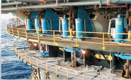
Cluster of tension style chain jacks on a Spar