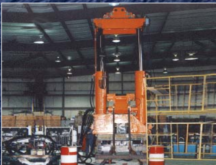
Factory testing of a compression style chain jack, capable of pulling in 375 tonnes