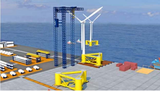
The Bardex OmniLift reduces both financial and HSE risk.

Imagine what would be accomplished if we simply ask, "How might we approach things from a fresh perspective?"