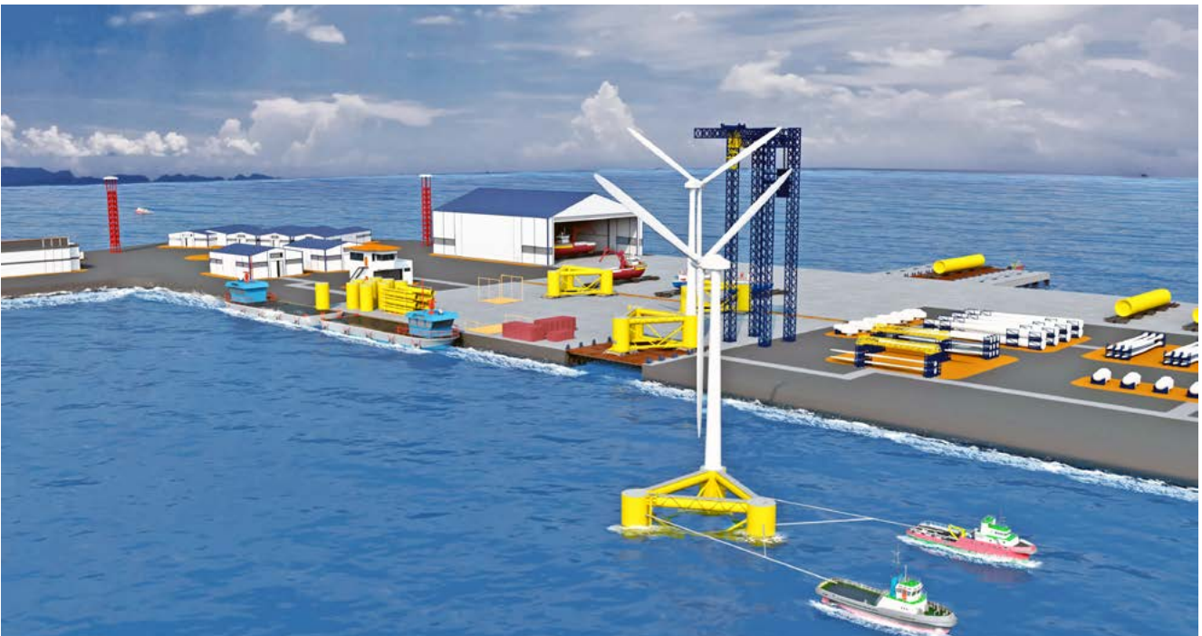
Eliminating and streamlining operations: The combination of OmniLift, rail transfer, and Bardex OmniCrane™ significantly reduces GHG emissions, creating a pragmatic solution true to the spirit of the global energy transition.