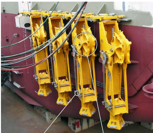
LATCH HOUSING WITH STOPPER LATCHES