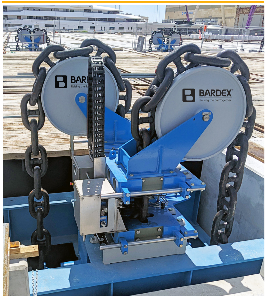
Chain jacks have been trusted to lift vessels since 1967.

Using locally produced concrete increases the local content of the project.