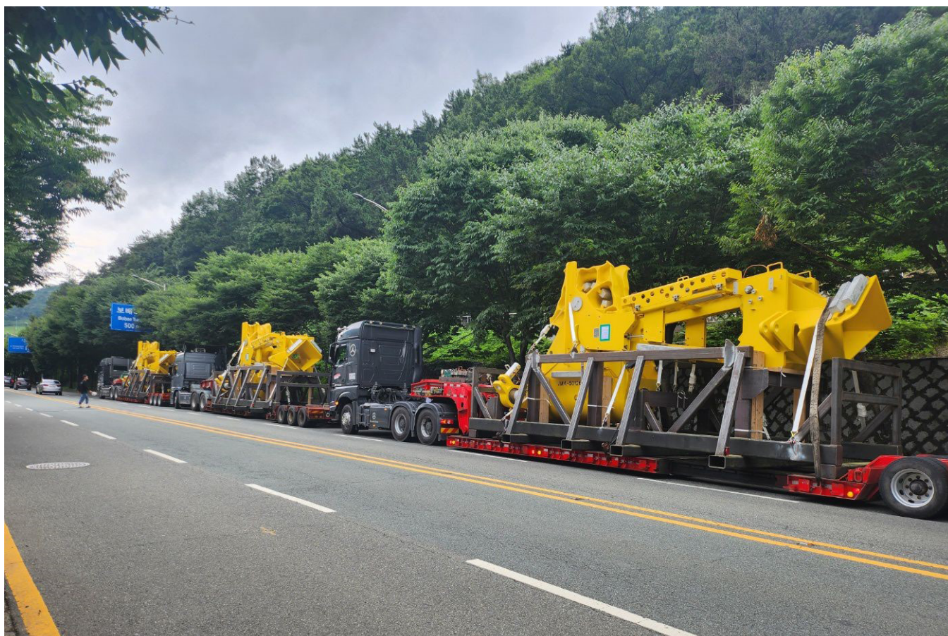
The UK facility will build upon Bardex's decades of experience building all of the equipment it designs. Advances in the BarLatch® design will mean approximately a 30% reduction in weight for future projects, but the cumulative need of six pieces per turbine in a development field adds up

maintenance trip, resulting in delays to wind turbine maintenance schedules, increasing risks for the operator. So, what better place to set up a vessel maintenance facility than the same place where the turbine assembly infrastructure was installed?