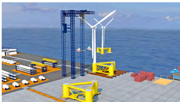
The Bardex® OmniLift® reduces both financial and HSE risk.

Imagine what would be accomplished if we simply ask, "How might we approach things from a fresh perspective?"