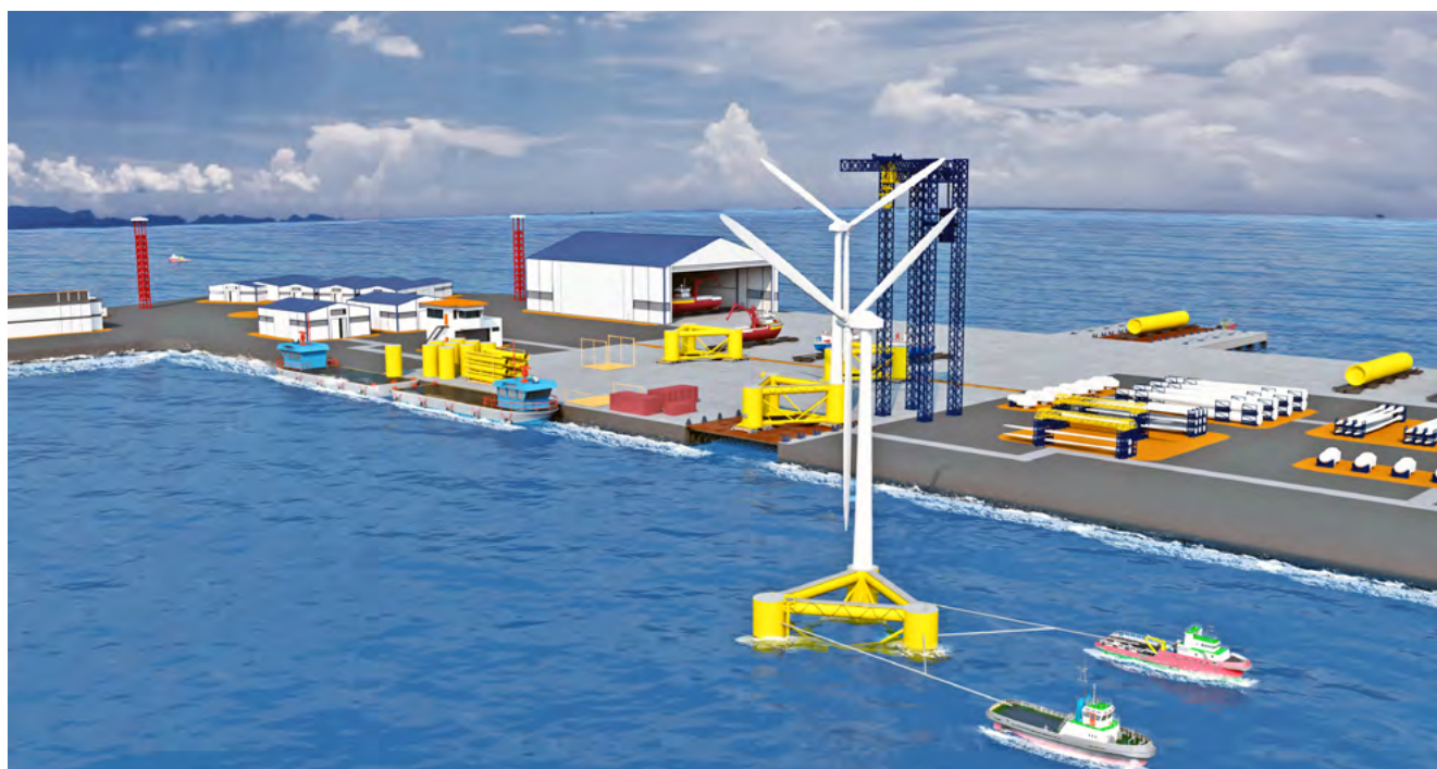
Eliminating and streamlining operations: The combination of OmniLift®, rail transfer, and Bardex OmniCrane significantly reduces GHG emissions, creating a pragmatic solution true to the spirit of the global energy transition.